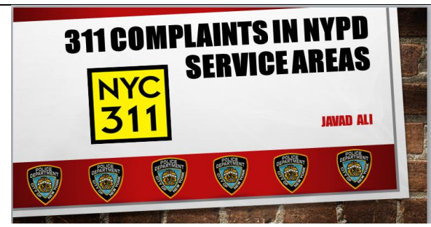
311 Complaints in NYPD Service Areas Javad Ali