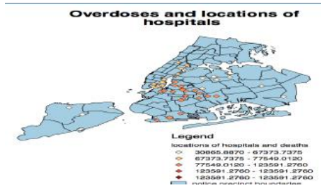
Using Neighborhood Drug Abuse and Income Analysis to Develop Tailored Abuse Intervention Programs Greg Pashayan