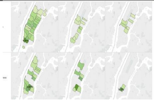
Analyzing the Food Security in NYC Ariana Zuberovic