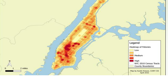
Identifying and Predicting Crime Hotspots in Mass Transit Stations using Big Data Analytics Austin Krauza