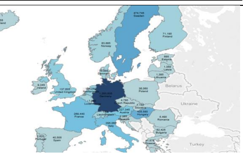
Refugee Migration Analysis Usman Ahmed