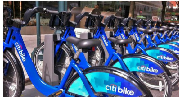
Big Data Analytics: Getting Insights from Bike sharing Rides Mudit Uppal